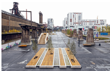
PUBLIC SPACE DESIGN/ ESCH-SUR-ALZETTE (LU)/ 2010