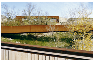
OPERA FESTIVAL AREA/ ST.MARGARETHEN (AT)/ 2008