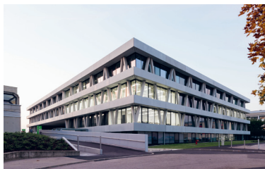
CENTER FOR TECHNOLOGY + DESIGN/ ST.PÖLTEN (AT)/ 2014