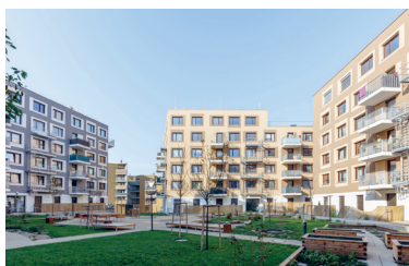
RESIDENTIAL QUARTER SEESTADT ASPERN/ VIENNA (AT)/ 2015