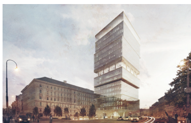
MIXED USED TOWER/ WIEN (AT)/ RECOGNITION 2013